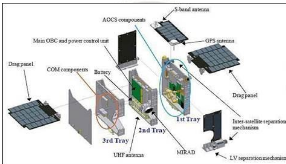
Fig 2.1 Satellite Structure

The space segment will obviously include the satellites, but it also includes the ground facilities needed to keep the satellites operational, these being referred to as the Tracking, Telemetry, and Command (TT&C) facilities. In many networks it is a common practice to employ a ground station solely for the purpose of TT&C.