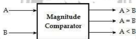
Fig : 2.21 - Block diagram of magnitude comparator

A magnitude comparator is a combinational circuit that compares two given numbers (A and B) and determines whether one is equal to, less than or greater than the other. The output is in the form of three binary variables representing the conditions A = B , A > B and A < B , if A and B are the two numbers being compared.