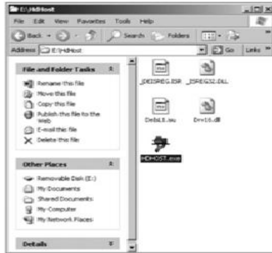
Fig: Displaying the contents of the HDHOST folder in Windows Exp