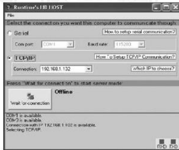
Fig: Selecting a connection type